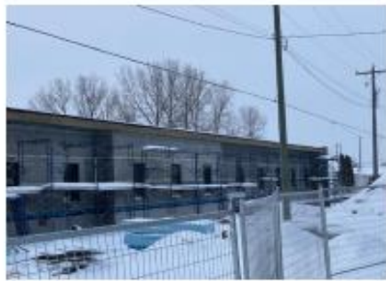
Photo of exterior of new inpatient unit.