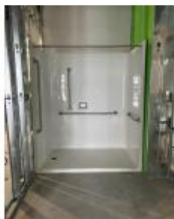
New tub bathing insert is in place.

We're currently hiring. To apply, learn more about positions or educational opportunities, visit www.ierha.ca/work-with-us/