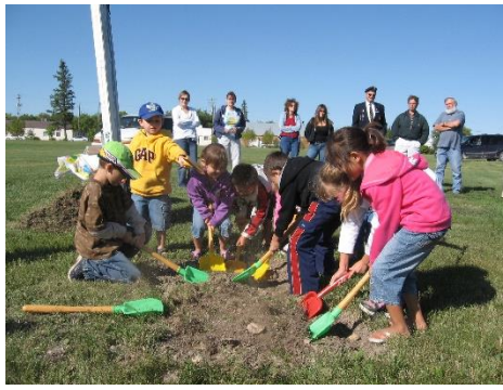
Ground breaking ceremony, August 15, 2007.

In 1994 the centre moved into a temporary location at TBJ Mall. Demand for child care continued to grow and resulted in the day care revising its license to include children aged 18 months. The growing and changing needs of our communities sparked an interest in building a new larger facility. Community surveys, the formation of a building committee, becoming a registered charity and the dream of a new stand-alone facility began.