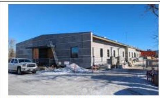
West end of the addition looking east