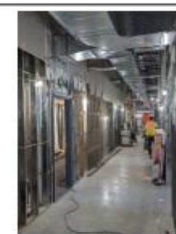
Interior corridor of new inpatient unit