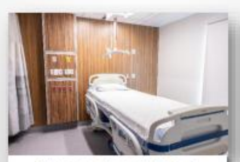
Floor to ceiling windows in patient rooms