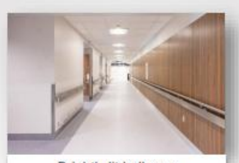
Brightly lit hallways